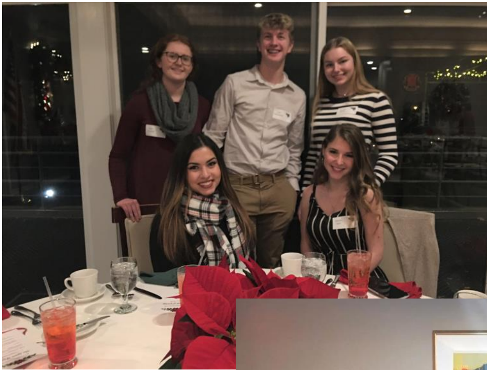
Maumee High School Interact members who helped with shopping.