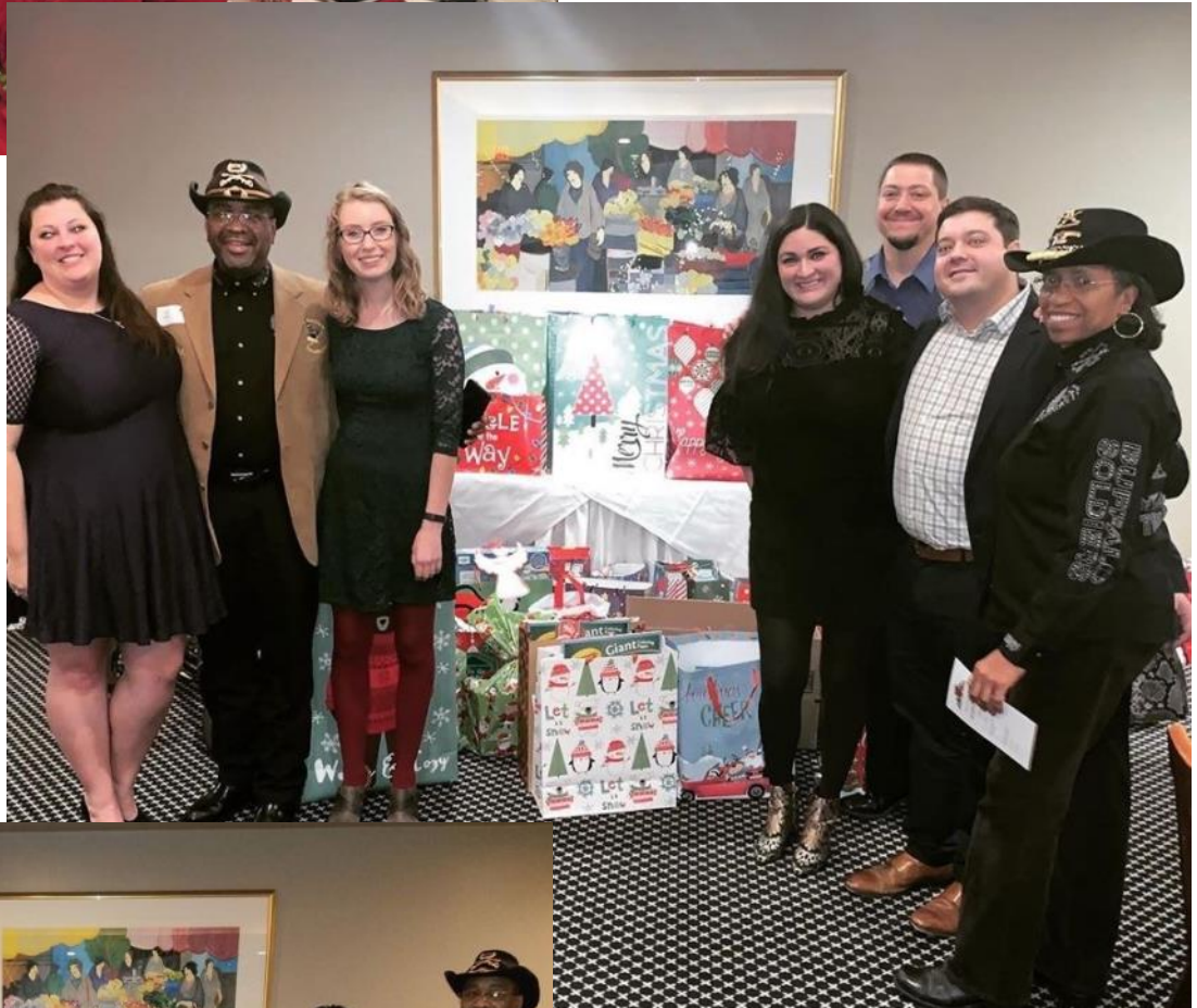
Maumee Rotary Rotaract members in front of gifts collected for Buffalo Soldiers